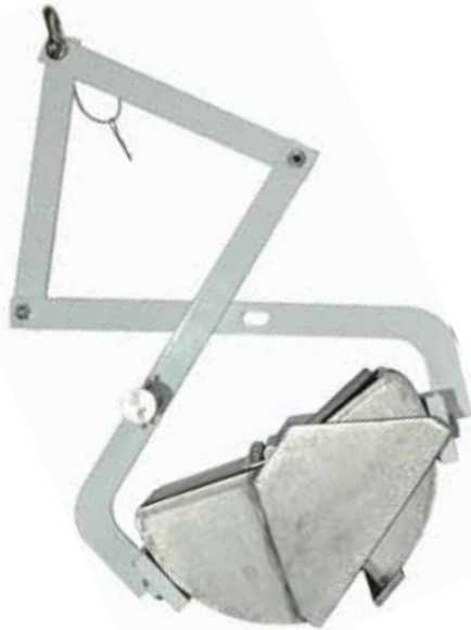
Part # 445.10

AMS bottom dredges are primarily designed for sampling sand and silt but can be made to sample most types of non-cohesive material, except hard-packed clay. They provide samples from which the sediment profile can be described.