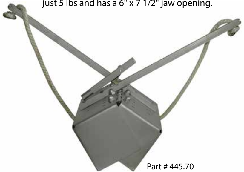
Part # 445.70

AMS bottom dredges are primarily designed for sampling sand and silt but can be made to sample most types of non-cohesive material, except hard-packed clay. They provide samples from which the sediment profile can be described.